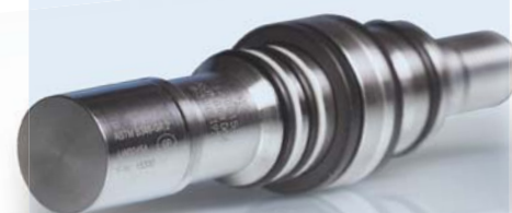
120 kHz transducer